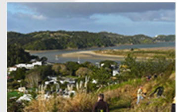
PUKE KOPIPI RESTORATION GROUP